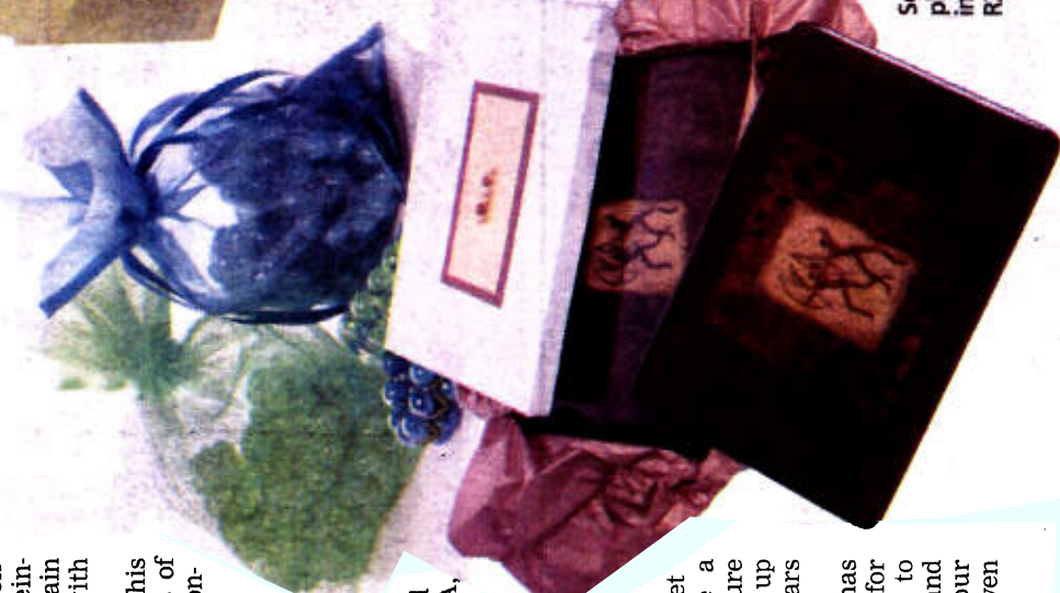
Set of four placemats in a box, R280.