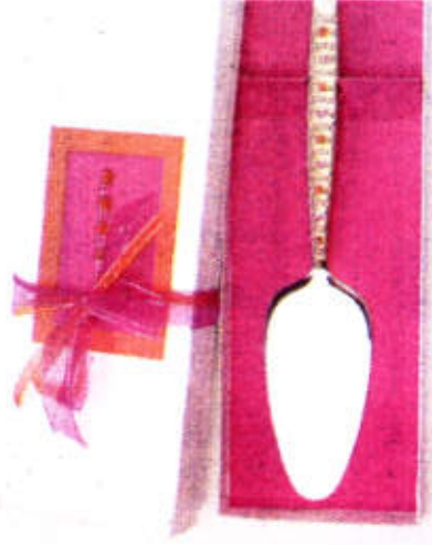
Beaded cake lifter, R80.