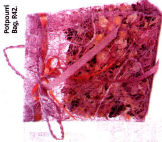
Potpourri Bag, R42.