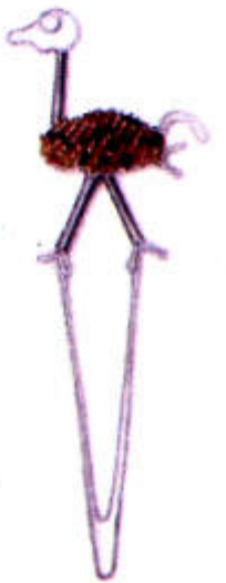
Ostrich Wire Bookmark, R49.

Odendaal says the deposit is refundable if the order is cancelled before production work begins.