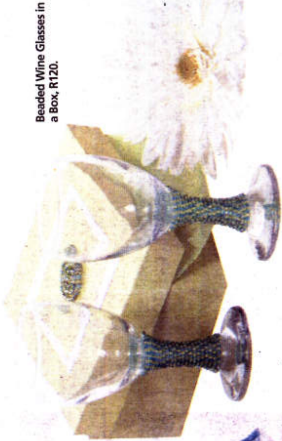
Beaded Wine Glasses in a Box, R120.