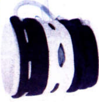
Mug Warmer, R30.